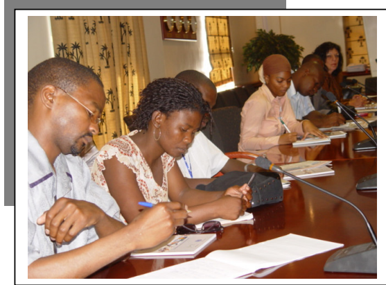
Some of the journalists who covered the event

"You possess the most powerful weapons in your works art for Africa to move forward. Only when you recognize this potent power will Africa move forward", he implored his audience.