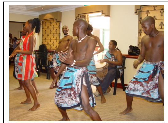
Ghetto Artists captured the audience's attention when they took to the stage to perform "We Are the Drums".