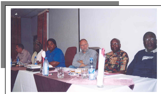
Heads of Agencies at the retreat

On the final day four UN inter-agency working groups explored topics ranging from how to implement the UN Reform in Botswana to initiatives on staff unity.