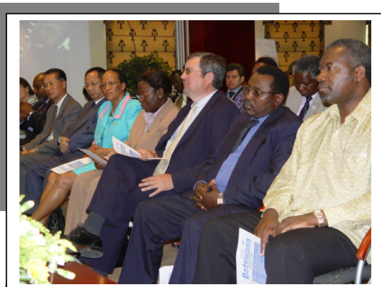
matic community, government senior officials, civil society as well as the media.

The occasion was also graced by the presence of the Executive Secretary for the Economic Commission for Africa, Mr KY Amoako. He is also chairing the Commission on HIV/AIDS and Governance in Africa established by the UN Secretary General. He is also a member of the Blair Commission