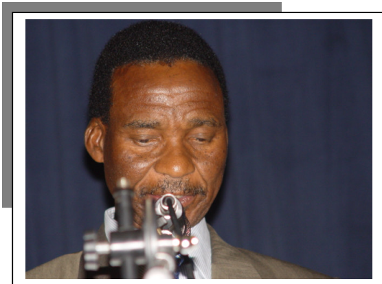
Minister of Finance & Development Planning, Mr Baledzi Gaolatlhe, when delivering the keynote address.

BOTSWANA'S FIRST MILLENNIUM DEVELOPMENT GOALS REPORT, RELEASED IN SEPTEMBER STATES THAT DESPITE HIGH LEVELS OF ECONOMIC DEVELOPMENT THE COUNTRY HAS ACHIEVED IN LAST THREE-AND-HALF DECADES THE SCOURGE OF HIV/AIDS AND HIGH LEVELS OF POVERTY REMAIN KEYS CHALLENGES FOR THE SOUTHERN AFRICAN NATION. LAUNCHED BY THE MINISTRY OF FINANCE AND DEVELOPMENT PLANNING, HONOURABLE BALEDZI GAOLATLHE, IN BOTSWANA'S CAPITAL CITY GABORONE, THE REPORT EXAMINES THE PRELIMINARY PROGRESS THE COUNTRY HAS MADE SO FAR IN THE EIGHT MILLENNIUM DEVELOPMENT GOALS (MDGs) AGREED TO BY WORLD LEADERS IN 2000.