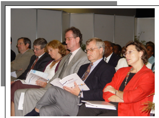
Members of the diplomatic community, researchers, civil society, media as well as government senior officials, among others, attended the launch.

The report, written in a user-friendly format, will be distributed to all sectors of the society, including village development committees and grassroots organisations.