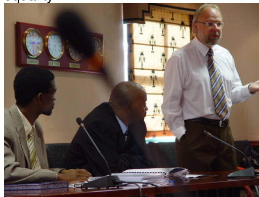
Mr Bjørn Førde the UN Resident Coordinator, lecturing to Foreign Affairs staff

overarching goal of fostering and maintaining international peace and security as symbolized by the General Assembly, where 190 heads of states meet annually to discuss and try to resolve socio-economic and political issues by consensus. And all nations regardless of geographic and demographic size are entitled to one vote each on the basis of the principle of equality.