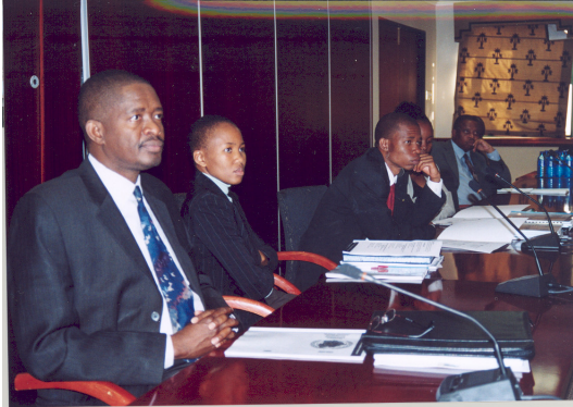
Some of the participants attending the induction programme

dedicated to a review of the achievements of the UN as an organization and the status of attainment of the Millennium Development Goals by member states. The summit is officially called the Millennium + 5 Summit. He pointed out that human rights have always been the center piece of UN activities as seen from the UN Charter itself.